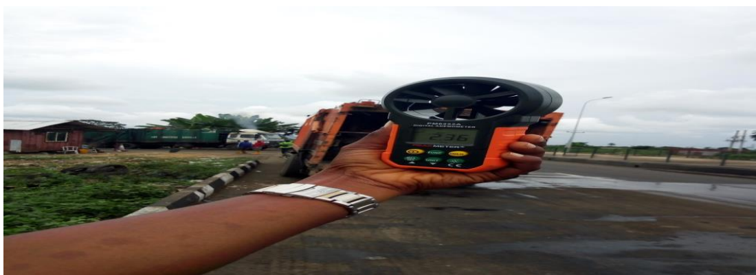
Plate 2. Measurement in process.

population which is statistically acceptable, Ezeh (2005) as cited in Ogoloma (2012). This gave the study a sample size of 93.5 approximately 94 households. Therefore, the sample size for the study is 94 households but attention was strictly given to house hold heads as the recipient of the questionnaire, which was administered through simple random sampling for only respondents who reside within 1 km radius of the area. The questionnaire was distributed with the support of field assistants and the recipient which are the household heads were asked to go through the questionnaire and respond adequately, hence they were allowed to keep the copies for a period of three days where after it was retrieved for analysis.