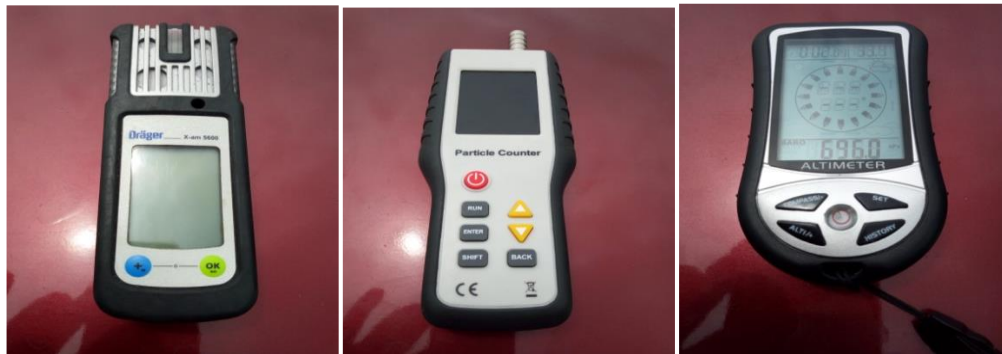
Plate 1. Dräger-X-am5600 and Particle Counters.